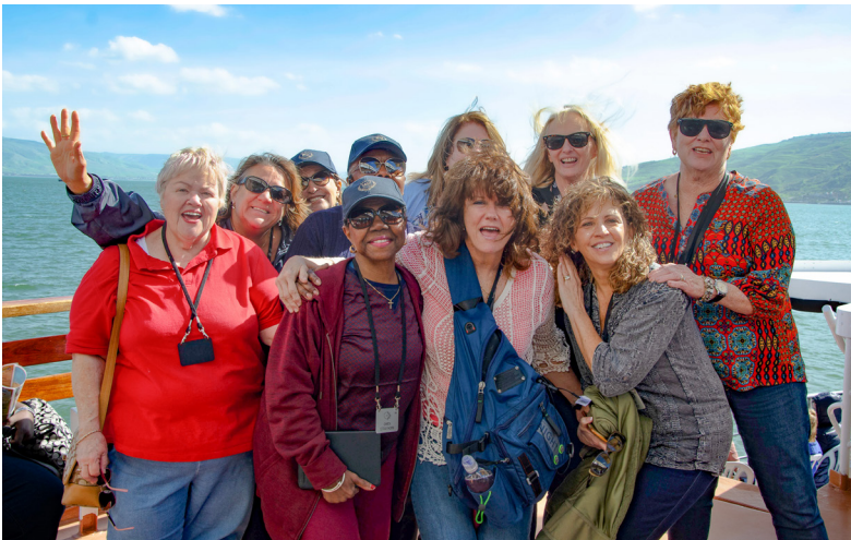
Tour = TH25 Code = G V. 003 02/29/24